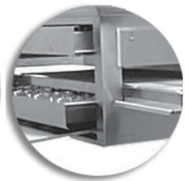
Removable panels for easy cleaning